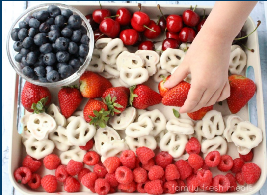
Easy Flag Fruit Dessert